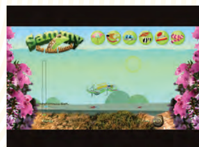
Screengrabs from environmental climate change adaption game, helping Sammy the sand lizard survive