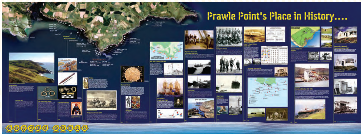
3m x 1.5m panel showing a combined historical timeline and wreck guide overlaid onto a contemporary satellite image

35 Longbrook Street, Exeter, EX4 6AW t 01392 499455 f 01392 453467 info@freeline-gfx.co.uk www.freeline-gfx.co.uk skype: freeline-gfx